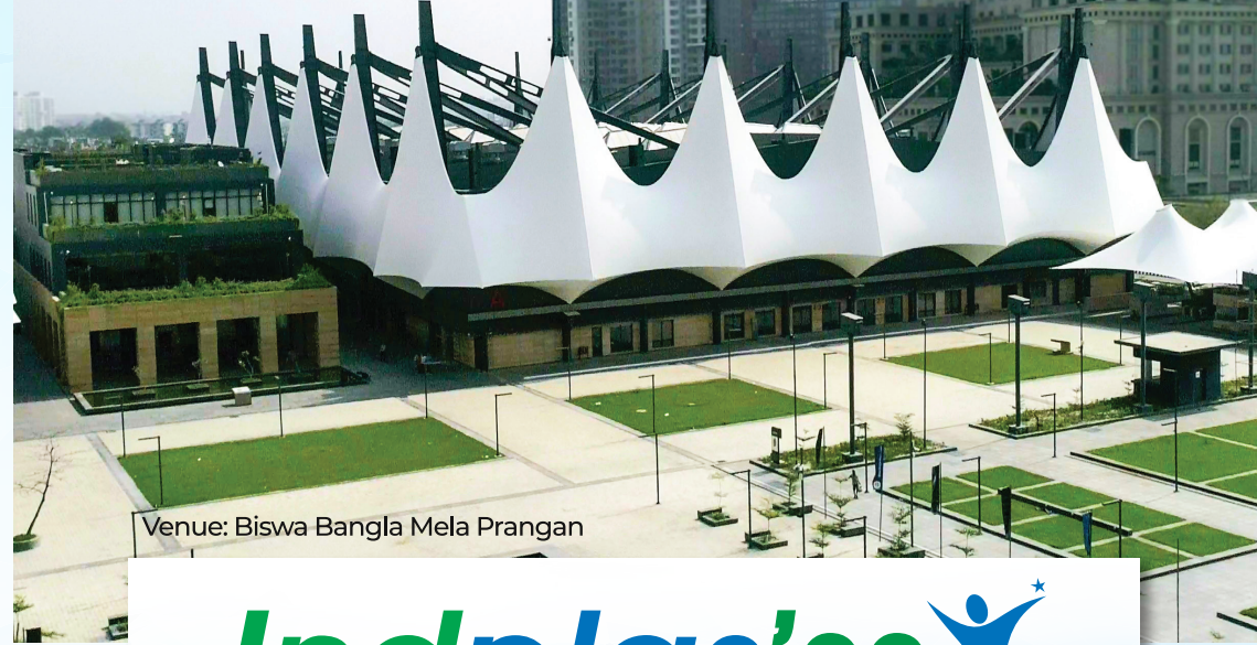
Venue: Biswa Bangla Mela Prangan

Since 1981, when IPF organised the first ever Plastics Exhibition in India, it has held a total of 8 editions up till 2018. Owing to the past performance, the 9th edition has received tremendous support from the Industry and Government.